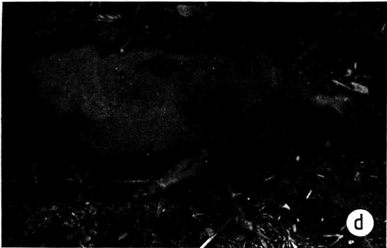
FIG. 2 (suite)