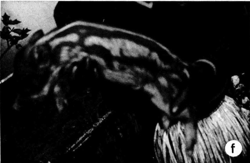
FIG. 2 (suite)