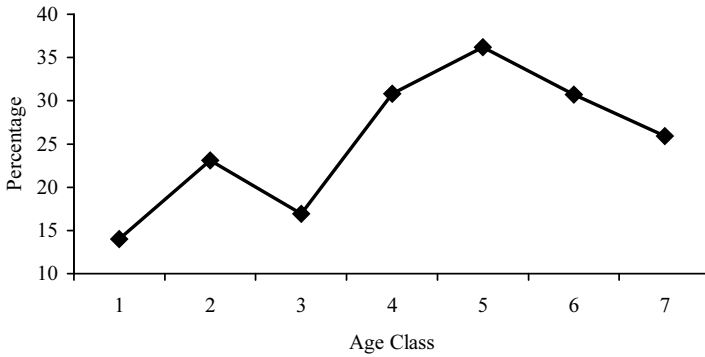
Figure 1. Linear model solutions for age effect on spontaneous, out-of-season ovulatory activity; 1 = young ewes that had never lambed before; 2 = older ewes that had not lambed in previous season; 3, 4, 5, 6, 7 = ewes that lambed for the 1st, 2nd, 3rd, 4th, and 5th or greater time, respectively, in the previous season.